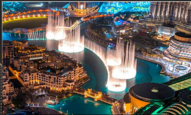
The Majestic Dubai Fountain

PIONEERS IN CURATING FUSION OF ICE, WATER & FIRE