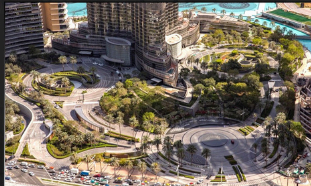
Iconic Burj Khalifa