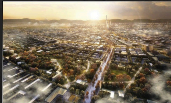
Premium Residential Tashkent