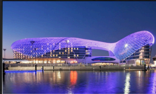
Mesmerising W Yas Island