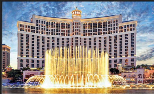
The Fountains of Bellagio