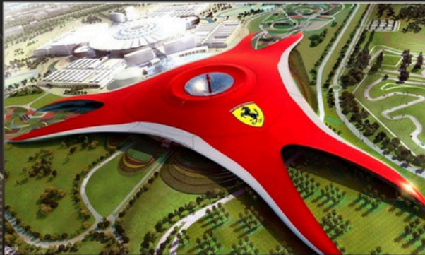
Ferrari World Abu Dhabi