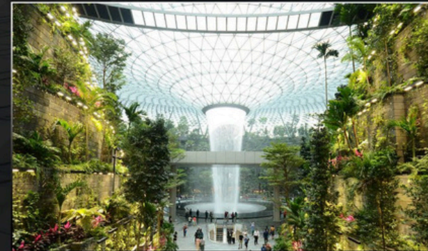
Changi Airport Singapore