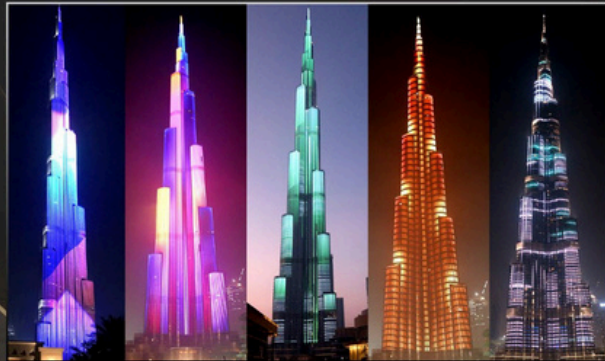
Burj Khalifa's Media Facade