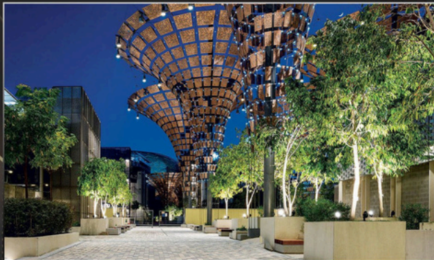
Dubai Expo 2020