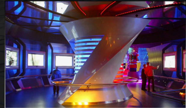
Space Park Germany, UK