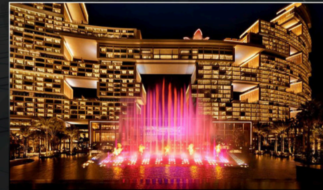
Atlantis The Royal Dubai